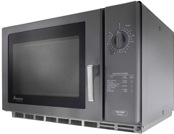
Model RCS10DA shown