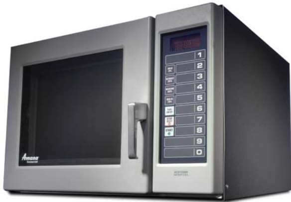
Model RCS10MPA shown