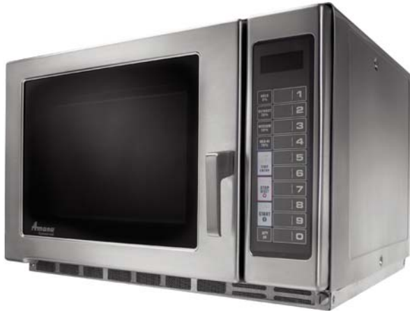
Model RCS10MPSA shown