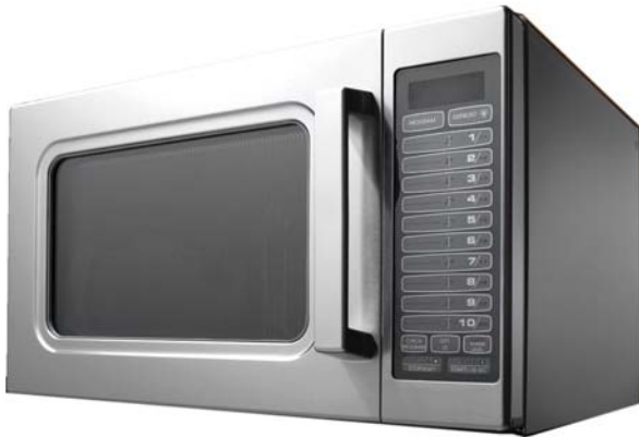
Model ALD10T shown