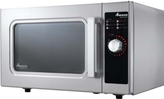
Model ALD10D shown