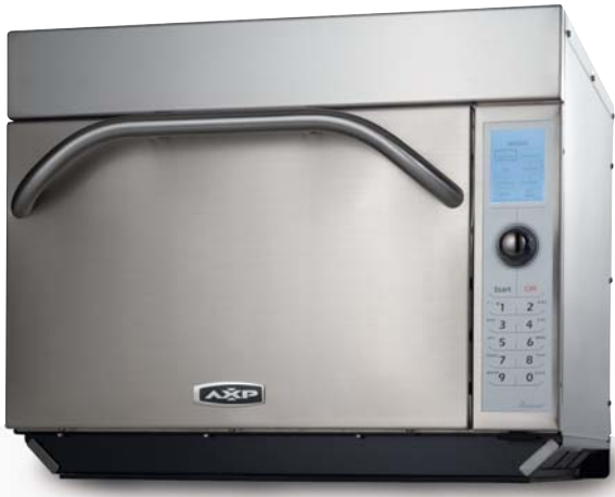
Model AXP20 shown