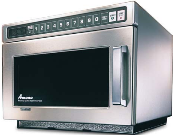
Model HDC212 shown