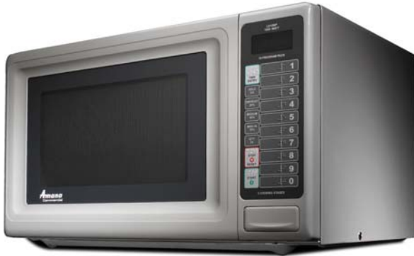
Model LD10MP shown