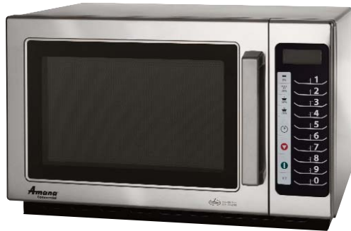
Model RCS10TS shown